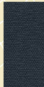
474 Navy Blue