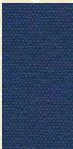
464 Royal Blue