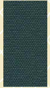
479 Forest Green