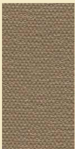
465 Hemp Beige