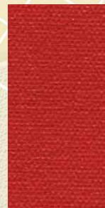
477 Sunset Red