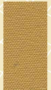
470 Buckskin Tan