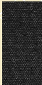
471 Onyx Black