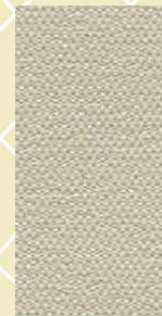
472 Indian Birch