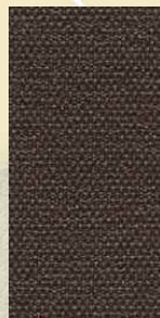
469 Chocolate Brown