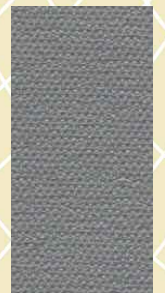
467 Sea Gull Gray